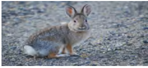
ta punt = cottontail rabbit