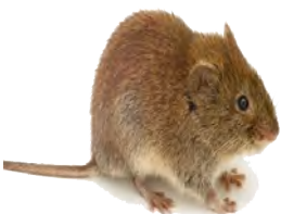
tsu mül = mouse