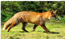
kloo bal = fox