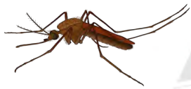
pe sht = mosquito