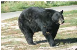
u nal = bear