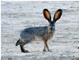
tsu'it = jack rabbit